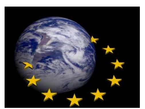
Indeed, it was from Europe that the idea went forth some 25 centuries ago to institute a social order in which citizens would be masters of their own decisions and which would depend on no authority other than their freely expressed common well. This was the greatest revolution in the history

We should understand the Europe of Culture to mean the deep-rooted sense of belonging to a common intellectual and spiritual tradition, the possession of a common well of respect for the