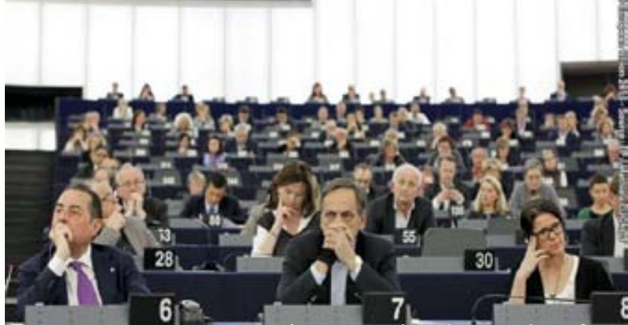
The agreement to return migrants and asylum seekers from the Greek islands to Turkey, reached at the meeting of heads of state or government on 18 March in Brussels, will be at the centre of a EP debate with Council President Donald Tusk and Commission President Jean-Claude Juncker today at 9:00.